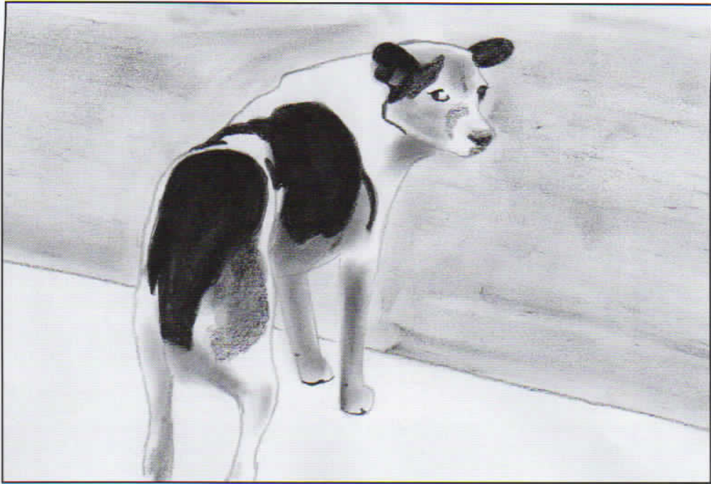
His Mother's Voice